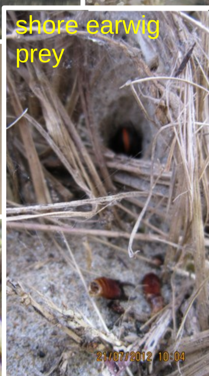
shore earwig prey