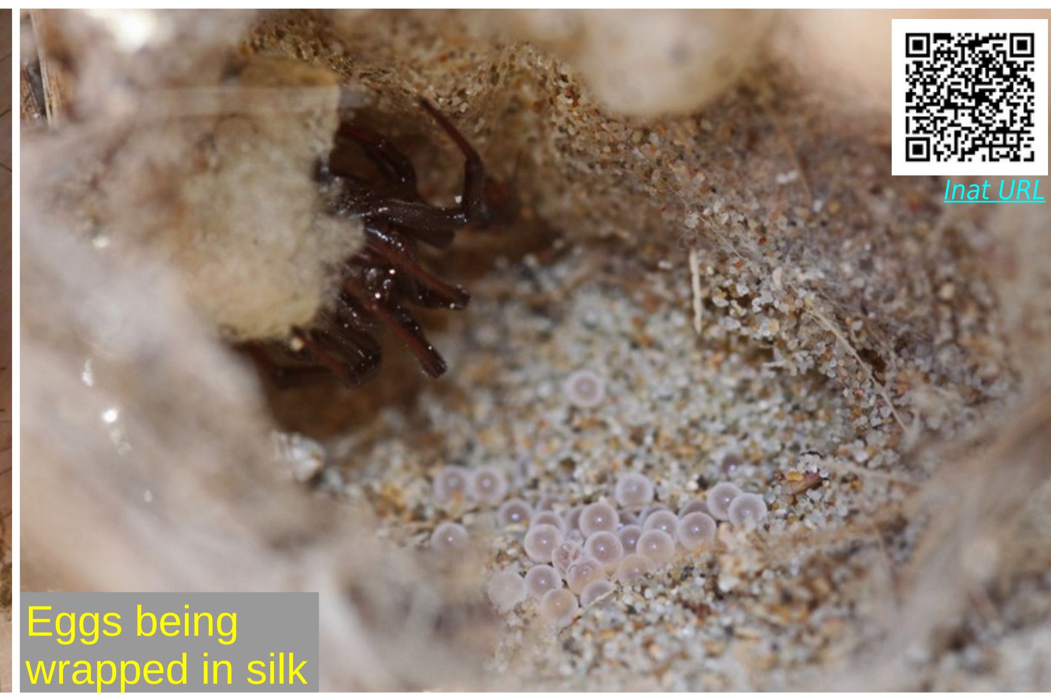
Eggs being wrapped in silk