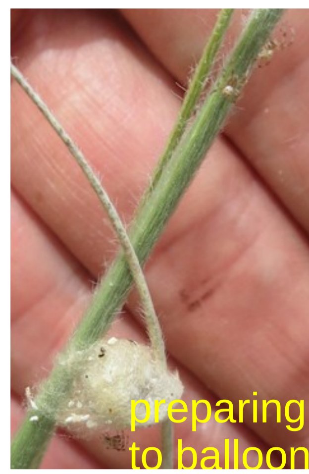
preparing to balloon