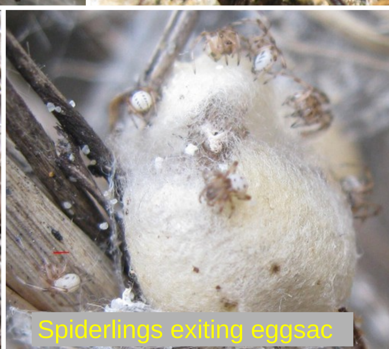
Spiderlings exiting eggsac