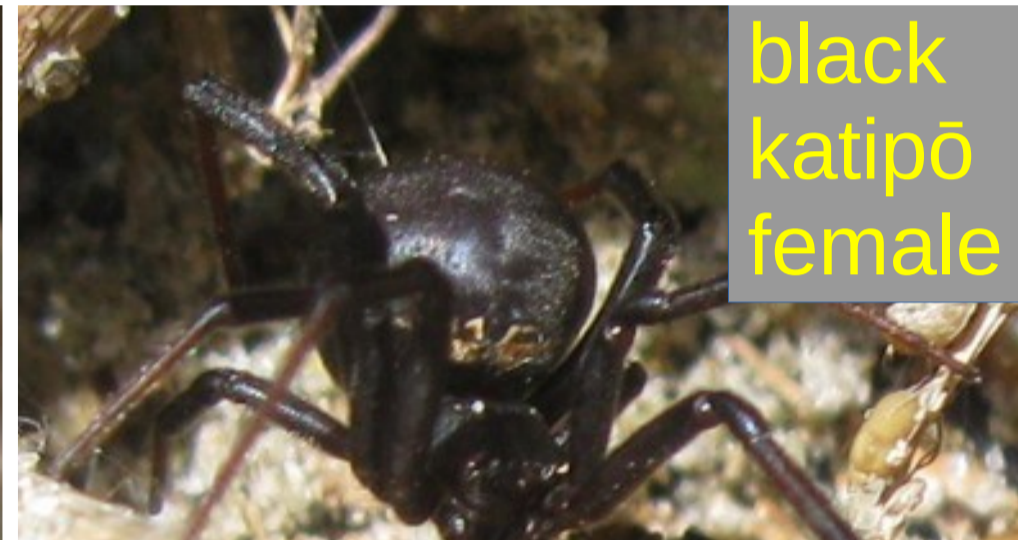
black katipō female