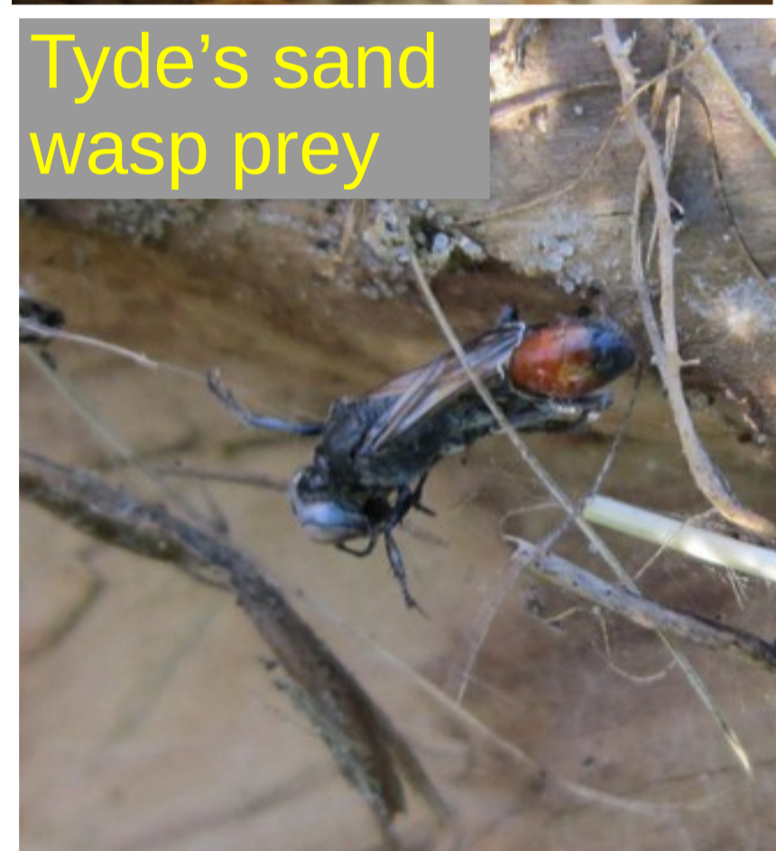
Tyde's sand wasp prey