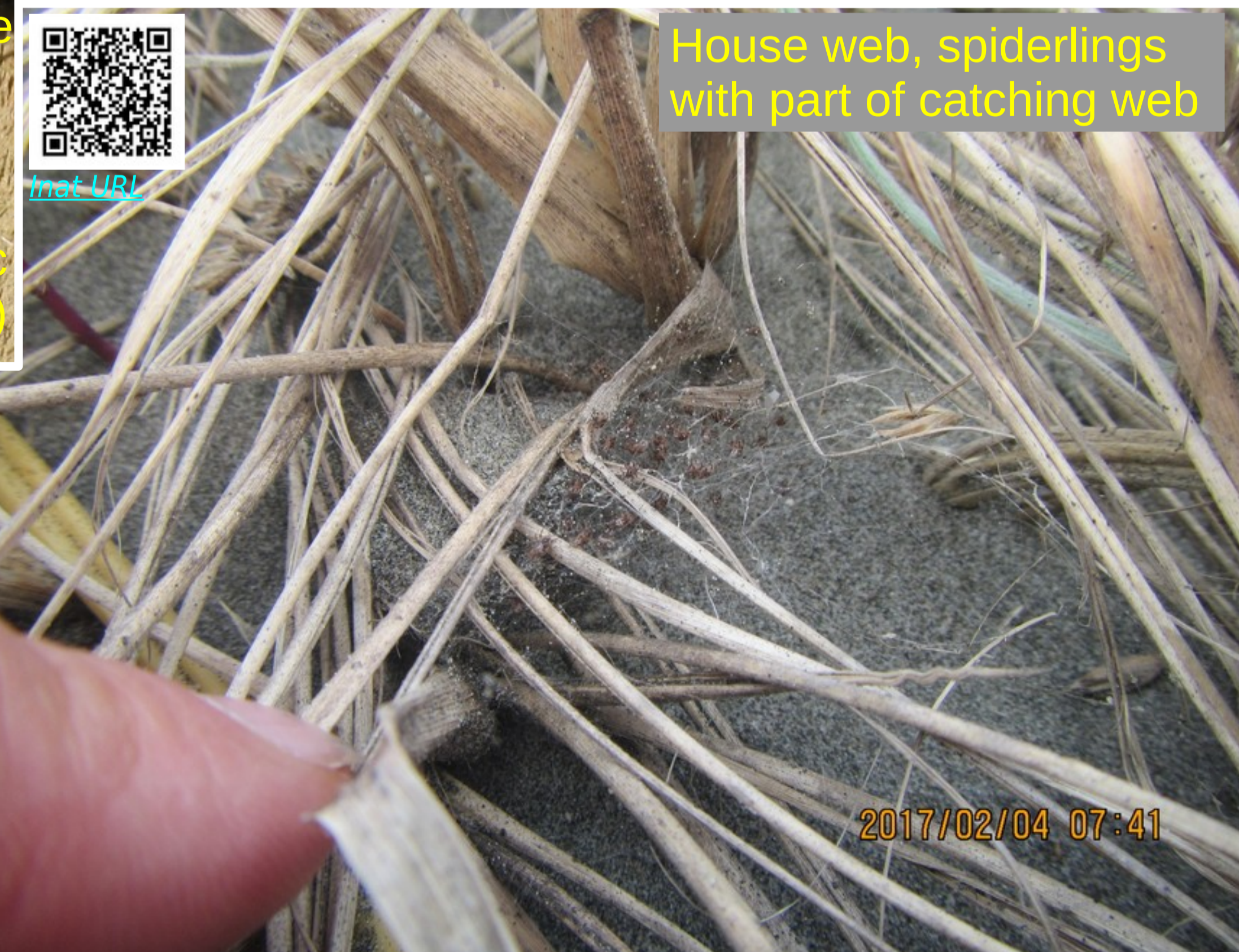
House web, spiderlings with part of catching web