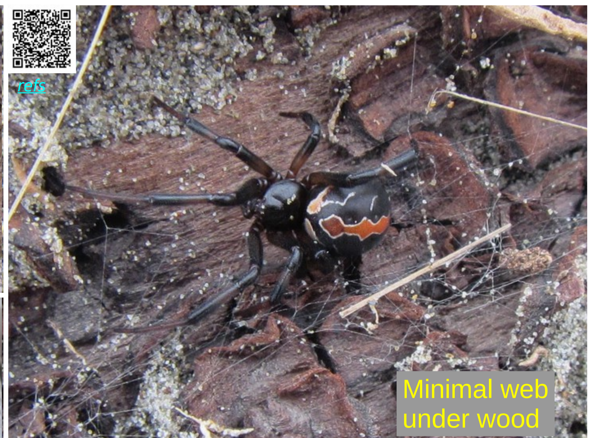
Minimal web under wood